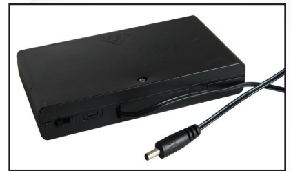
(1) Battery Pack with 3.5DC Male Plug Cable (batteries not included)