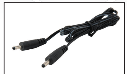
(1) 3.5DC Male Plug Cable

Part Number: 3115049 Retrofit Only See your AMSEC Sales Rep for more info!