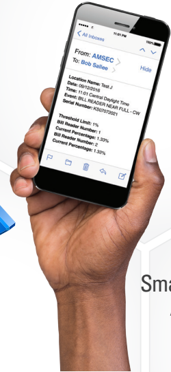
Smart Phone Alerts