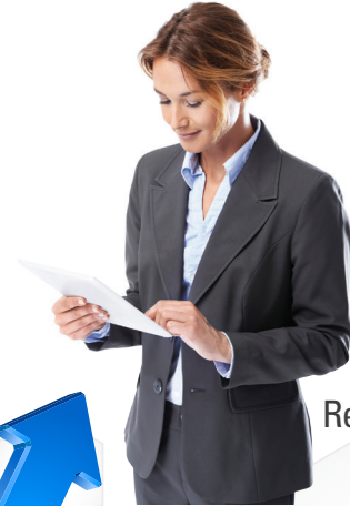
Remote Management via Mobile App